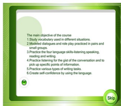
Appendix 2: Course Objectives