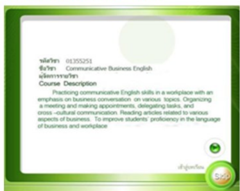
Appendix 1: Course Description